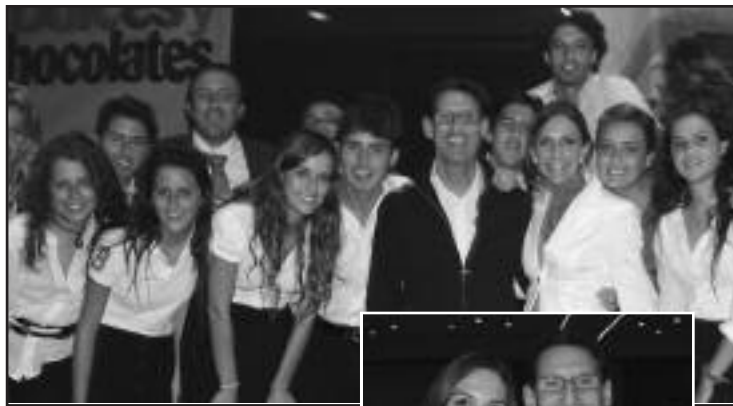
Young people of Guadalajara, Mexico who organized the presentation for 600 people in September.

Counselor Training Program , teaching therapists and ministry leaders how to help those with unwanted SSA and their loved ones. At IHF, we have developed two successful protocols: (1) a four-stage model to come out of homosexuality, and (2) a twelve-stage model for family members, teaching them to help their SSA loved ones heal. If you would like to organize a Counselor Training Program in your community or church, please contact our office at (301) 805-6111.